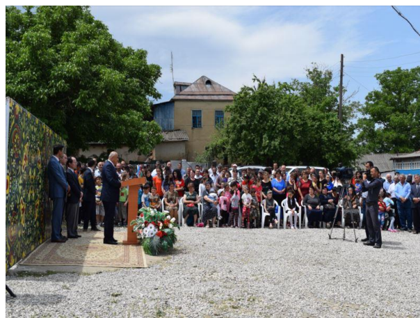
Villagers who participated in the ceremony